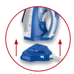
also to use wirelessly